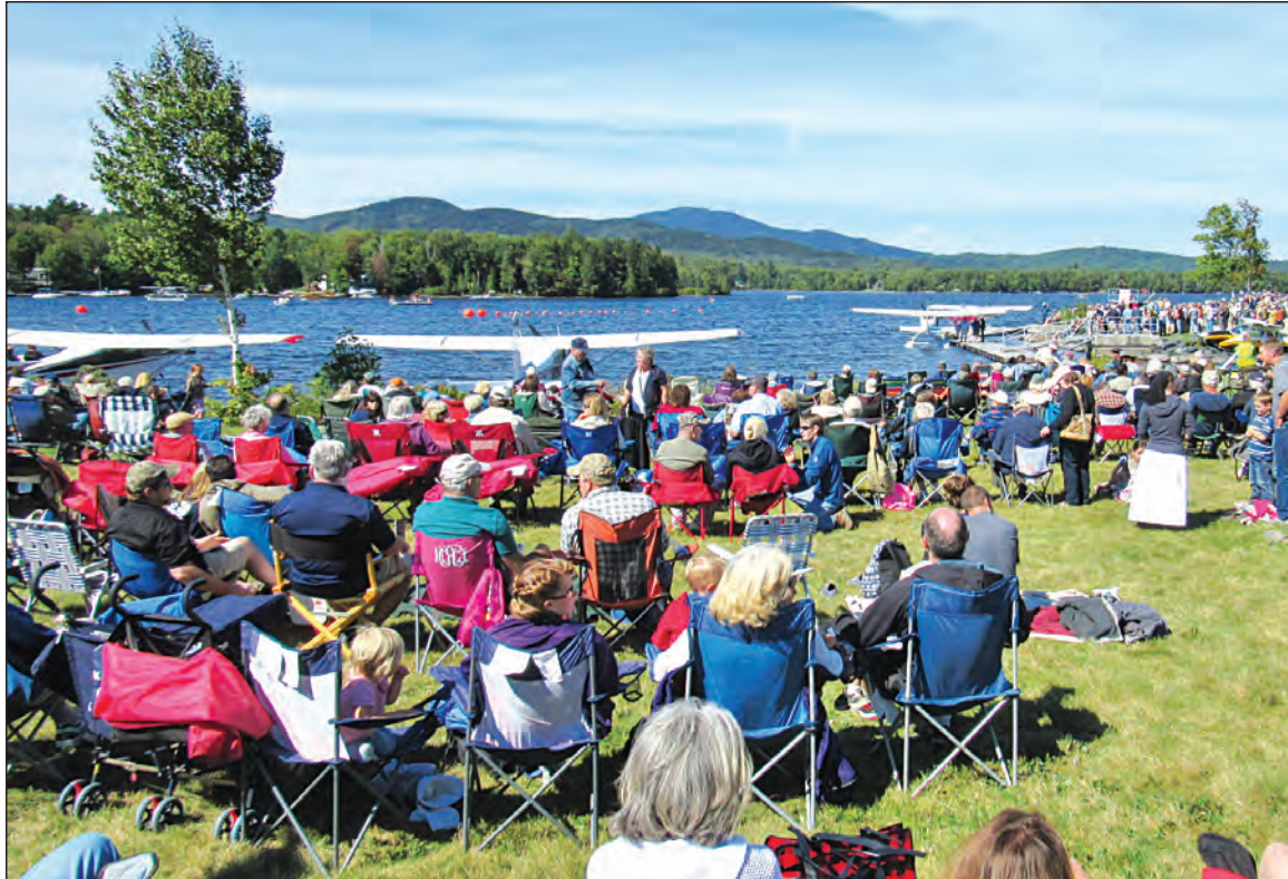
BEST SEATS IN THE HOUSE – Hundreds of people gather at Stobie Seaplane Base in Greenville each year for the International Seaplane Fly-In. High winds delayed the pilots' competition last year, but the weather was near-perfect for the rest of the day.