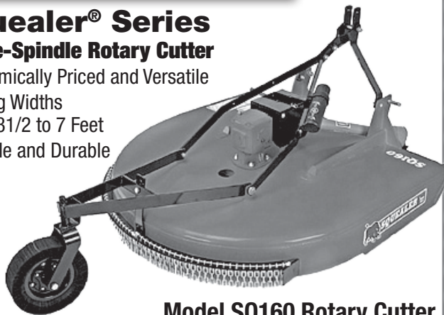
Model SQ160 Rotary Cutter