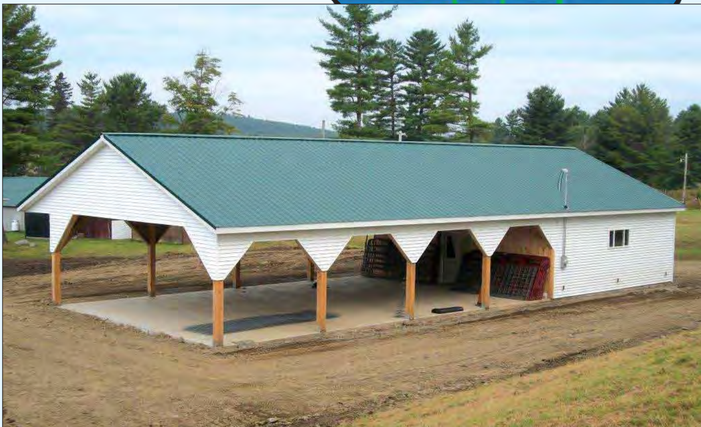
NEW FIBER ARTS LIVESTOCK BARN

The Harmony Labor Day Free Fair opens Friday night August 30, with a ribbon cutting at the Fair's newest and largest building. The multi-use structure will showcase both fiber arts and the animals that produce the raw materials. Daily demonstrations will include spinning and hand carding.