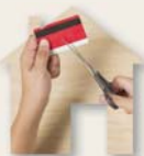
Knock down high interest debt?