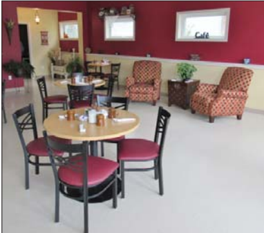
NEW EXPANSION – Elaine's Bakery and Café has more than doubled its seating capacity and will host a grand reopening on Friday, June 3 – National Donut Day.