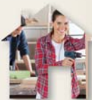
Fix up your home?

More than just a line, it's straight talk and a fair deal. Call 800.303.9511 or visit SkowheganSavings.com