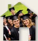
Pay for college?