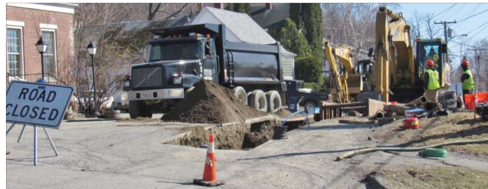
DIGGING IT – Construction of the Dexter Utility District's new water main line continues on Church and Spring streets. Crews finished this segment by the post office last week.